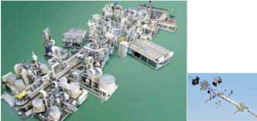
Steering Column Assembly Line

The Woojin Advantage | Our comparative labour advantage makes us one of the most cost competitive suppliers in the world, therefore customers benefit from favourable acquisition costs. Our innovative design and manufacturing methods enable us to provide lead times that are competitive with – and many times better than -- North American suppliers. Our manufacturing thought leadership results in superior processes. Examples of our technical innovations include the world's first roll and seam welding (resistance) production method we developed for muffler jackets, and a special, fully automated steering column assembly line.