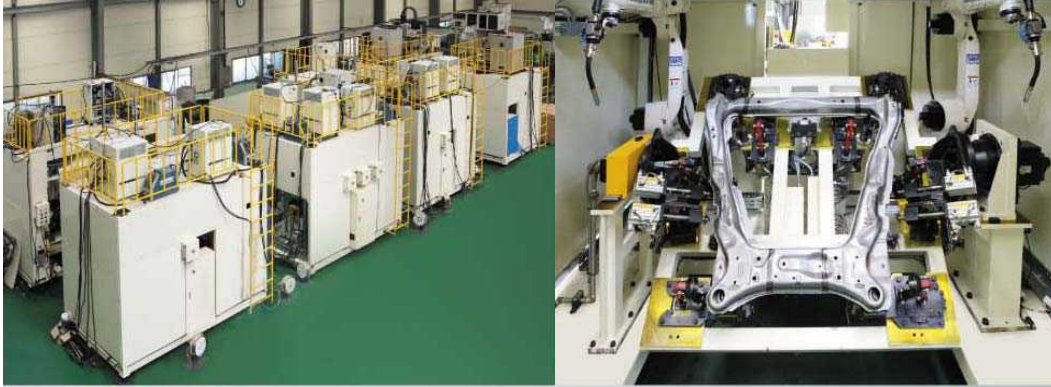
Front Suspension Assembly Line